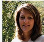
Producer - Personal Lines 704-893-2793 ext. 301