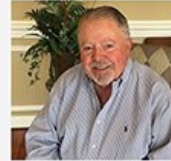
Producer 704-893-2793 ext 304