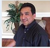
Producer 704-893-2793 ext 310