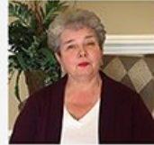
Service Consultant 704-893-2793 ext 302