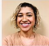
Producer 704-893-2793 ext 316